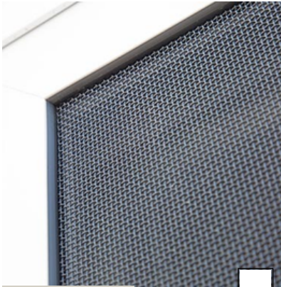
PRODUCT CODE: #01