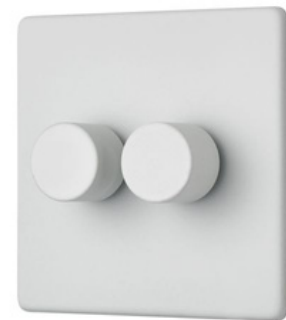
PRODUCT CODE: #06

Internal Upgrade & Additional external Fans Up to 70% more energy efficient than AC fans. Standard quote includes upgrading all internal fans & 2x external fans.