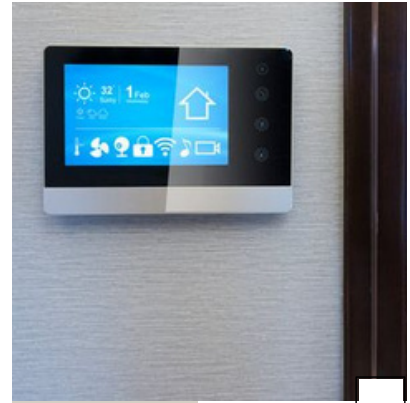
PRODUCT CODE: #03

This upgrade will only apply to some designer upgrade elevations.