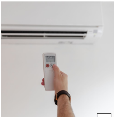
PRODUCT CODE: #04