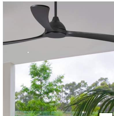
PRODUCT CODE: #05

Provide heating & cooling all year round! Quantity of units to be discussed in design phase. Standard quote 1x Living & 1x Bedroom.