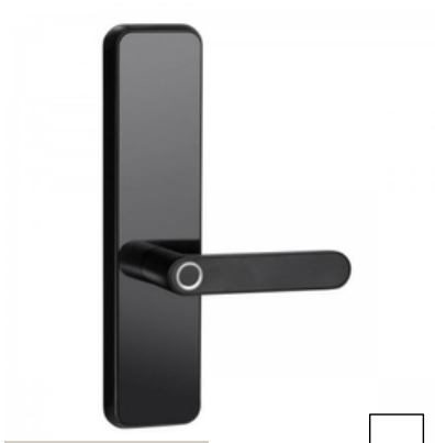
PRODUCT CODE: #02

Enhanced home security, safety against pests, enhanced ventilation & natural light. Quote will apply to all openings in chosen floor plan